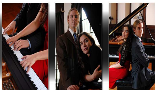
"Your connection with each other and the audience created an AMAZING atmosphere - the music was absorbed down to our souls!" Hudson Valley Piano Club